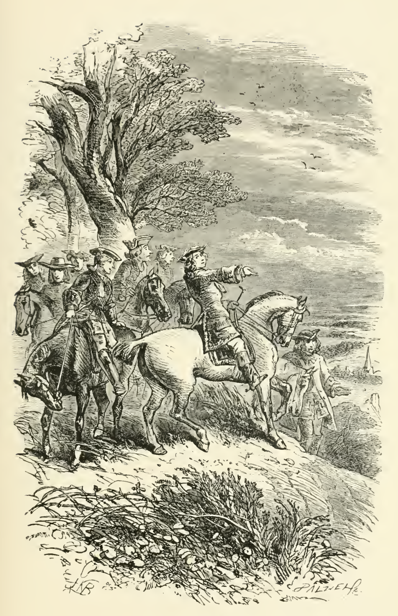
THE BEACON HILL.